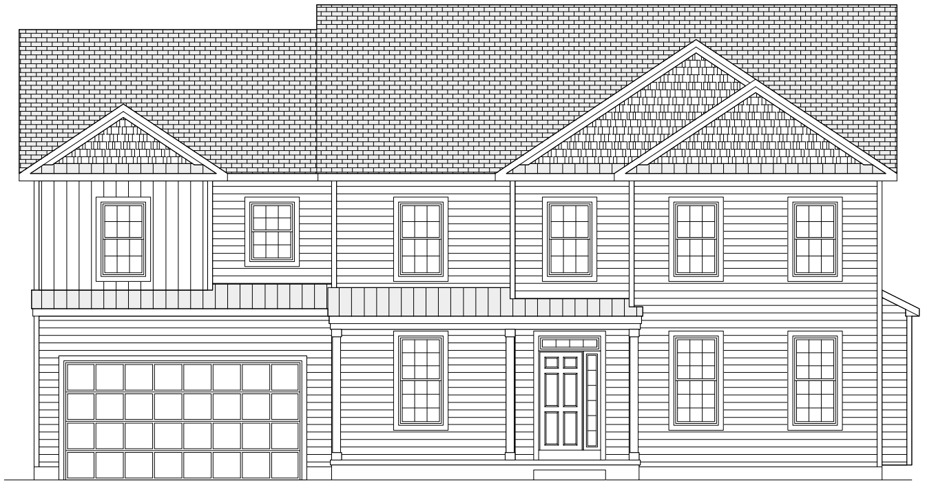
ELEVATION W/ FULL PORCH